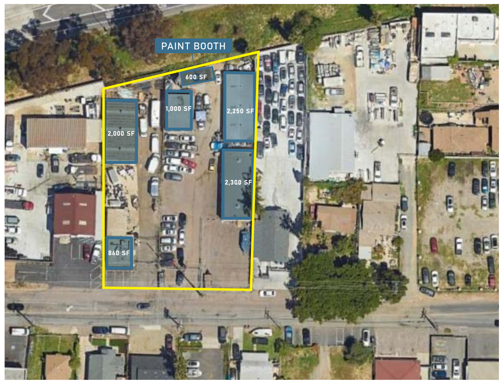
*ALL BUILDING SIZES ARE APPROXIMATE, BROKERS MAKE NO REPRESENTATION AS TO ACTUAL SIZE