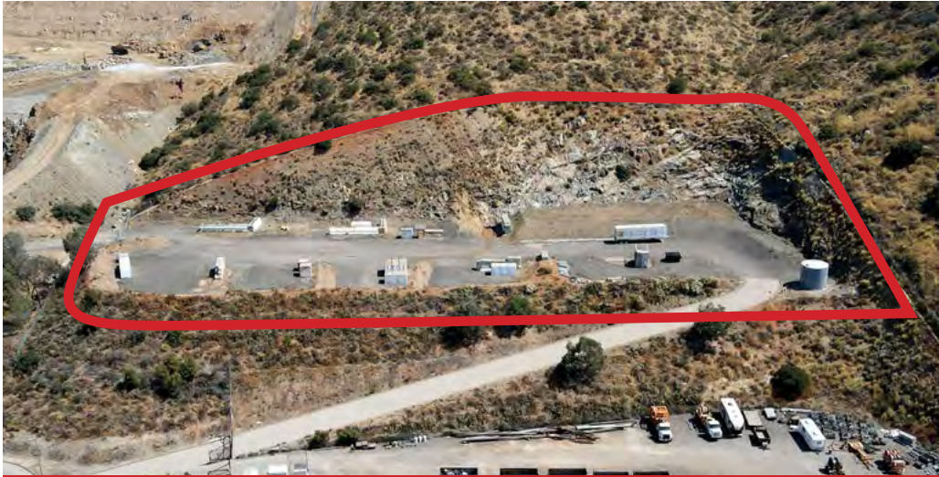
Pad 1 - ±1.87 Acres (Option 1)

HIGH IMPACT INDUSTRIAL LAND SITES located in East San Diego County. The properties are graded with level yards, excellent truck access, ideal for contractors yard, truck / trailer parking, storage of equipment and materials, etc.