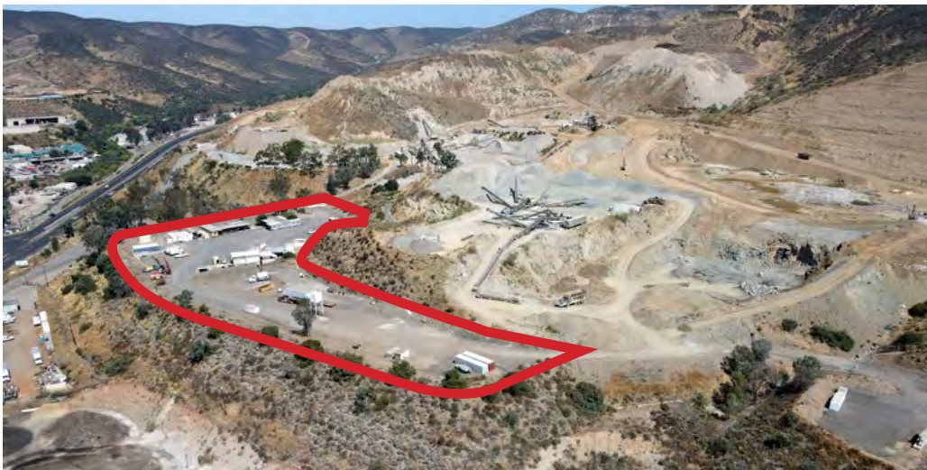
Pad 6 - ±5 Acres + 5,000 SF Office/ 2,850 SF Warehouse (Option 2)